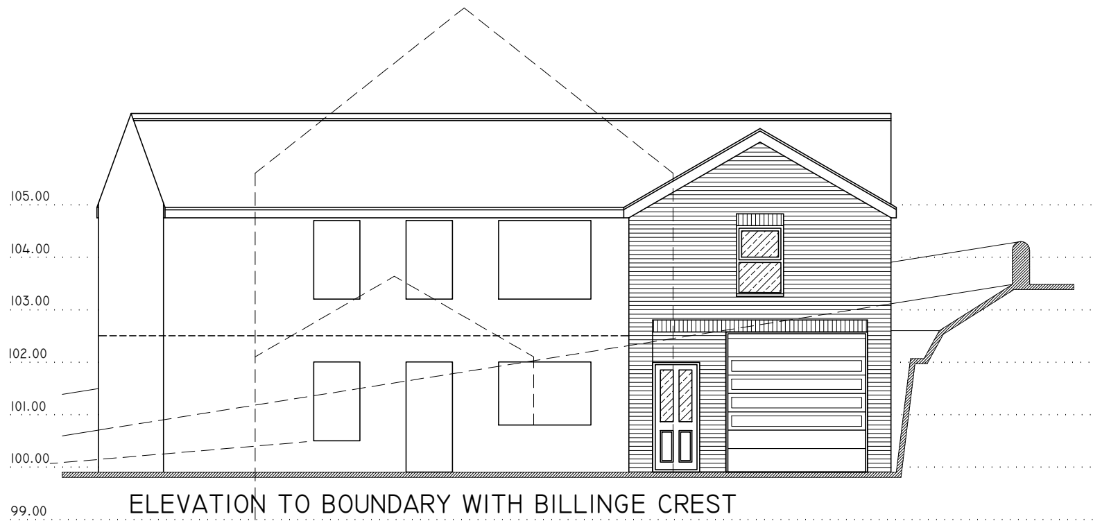
ELEVATION TO BOUNDARY WITH BILLINGE CREST

OUTLINE OF HOUSE & ANNEXE INDICATED BY DASHED LINES